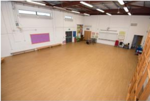
Enfield Heights Academy